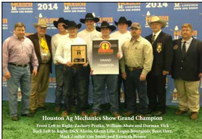
Houston Ag Mechanics Show Grand Champion

In closing I'd like to say thanks to each and every one of you. The future of agriculture and our youth are brighter because of your support. I pray that the Lord touches you and guides you in the direction he needs you to go.